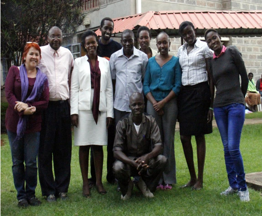
Group photo- Grassroots activists on Climate Justice